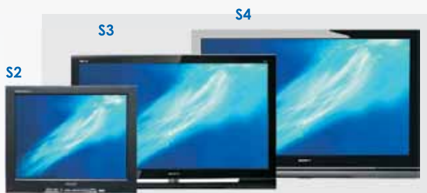
19" - HD Ready 485mm x 405mm 32" - HD Ready 790mm x 504mm 40" - HD Ready 990mm x 640mm