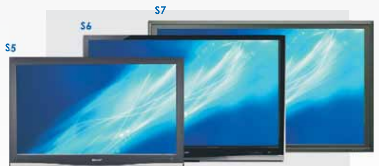
46" - Full HD 1113mm x 657mm 52" - Full HD 1254mm x 742mm 65" - Full HD 1572mm x 924mm