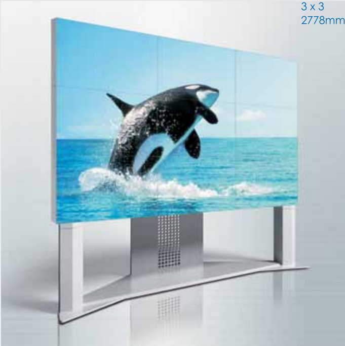
3 x 3 2778mm x 1569mm

Screencom is South Africa's leading supplier of Plasma Screens, LCD Monitors and peripheral equipment for daily hire at exhibitions, product launches, road shows, events and presentations.