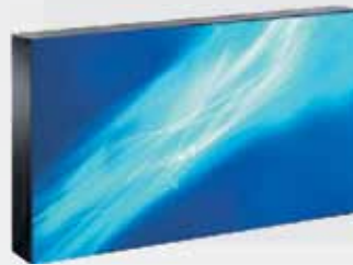
infinite module 926mm x 523mm